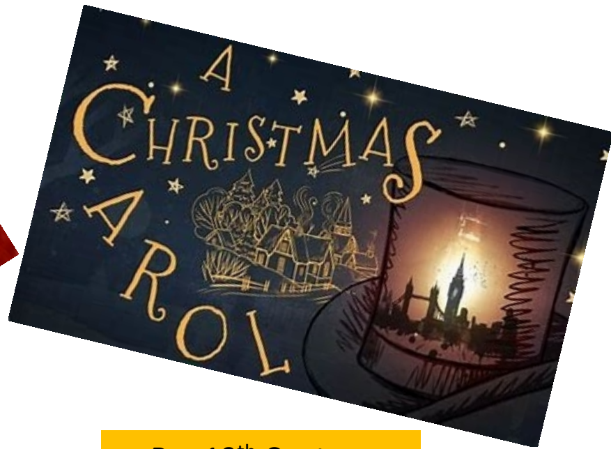
Pre 19 th Century