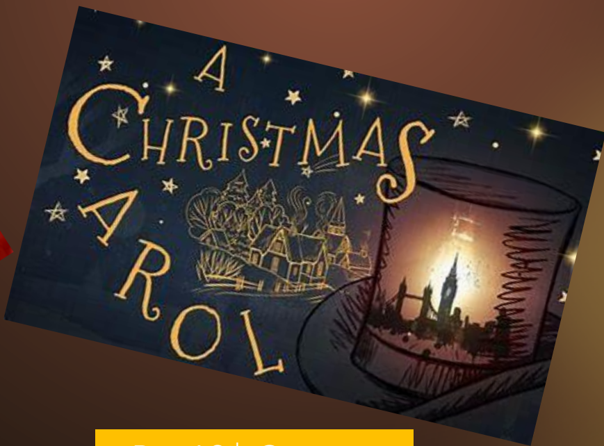
Pre 19 th Century